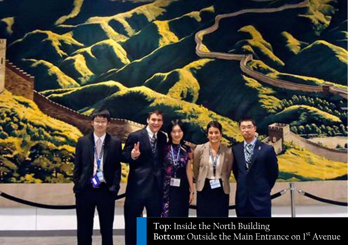
Top: Inside the North Building Bottom: Outside the Main Entrance on 1 st Avenue