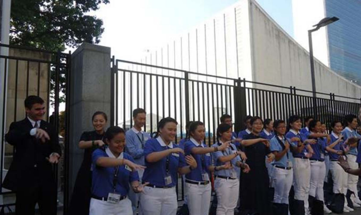
Top: Making new friends outside the UN Bottom: More new friends on Day 2 of presentations in the North Building