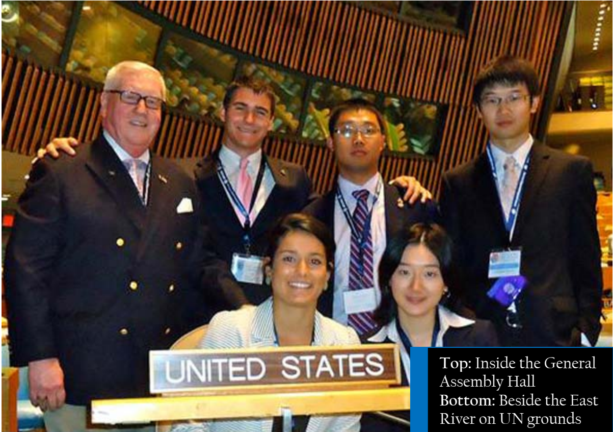
Top: Inside the General Assembly Hall Bottom: Beside the East River on UN grounds